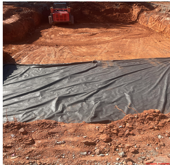
Grading & installing filter fabric for UDP