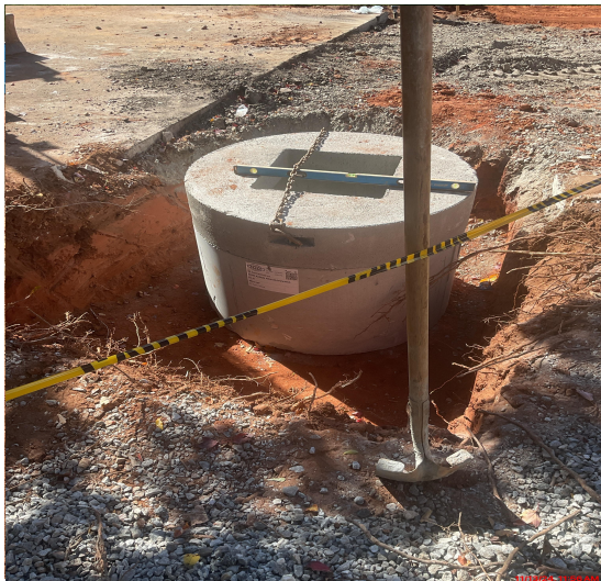
Storm Structure D1 installed