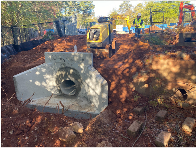
Backfilling head wall A1